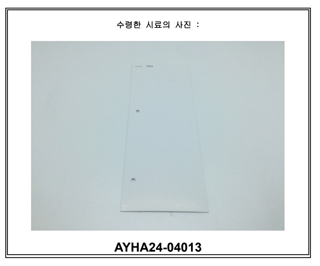
*** 끝 ***